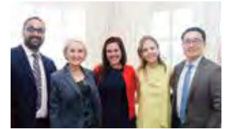
Educating our supporters with leading experts at our medical symposium

Breast Cancer Alliance is a premiere private foundation committed to funding early-stage, innovative and impactful research not yet eligible for federal grants. BCA uniquely bridges that gap by providing exceptional researchers with scientific venture capital, propelling life-changing scientific hypotheses from the conceptual stage to reality.