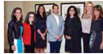
Meeting with our grantees to learn about the research we underwrote