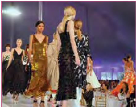
Runway by Oscar de la Renta