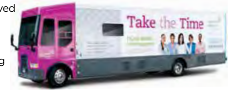
Funding screening for the underserved

Breast cancer survival rates are near 90% due to advances in early detection and improved education. BCA funds breast health education programs and covers costs associated with mammograms, biopsies and other breast cancer-related services, lessening the burden for underserved women.