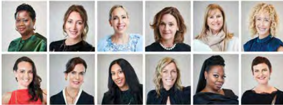
2020 Models of Inspiration