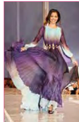
Runway by Brunello Cucinelli