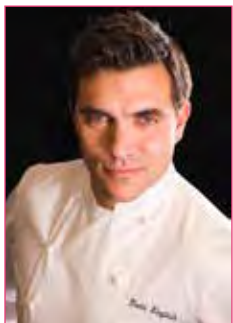
Chef Todd English