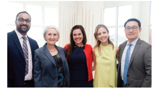
Educating our supporters with leading experts at our medical symposium

Breast Cancer Alliance is a premiere private foundation committed to funding early-stage, innovative and impactful research not yet eligible for federal grants. BCA uniquely bridges that gap by providing exceptional researchers with scientific venture capital, propelling life-changing scientific hypotheses from the conceptual stage to reality.