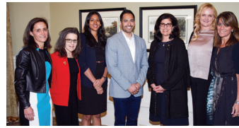
Meeting with our grantees to learn about the research we underwrote