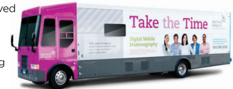
Funding screening for the underserved

Breast cancer survival rates are near 90% due to advances in early detection and improved education. BCA funds breast health education programs and covers costs associated with mammograms, biopsies and other breast cancer-related services, lessening the burden for underserved women.